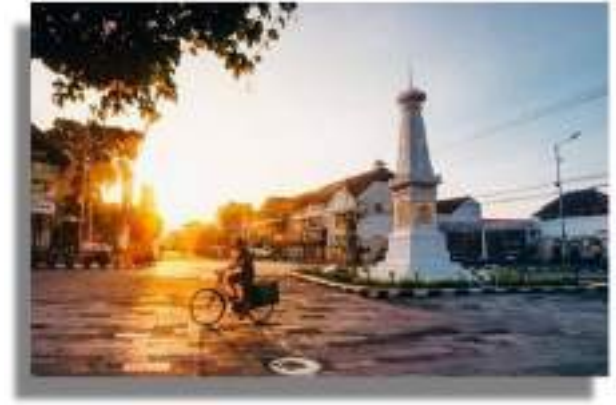
2023 - Yogyakarta