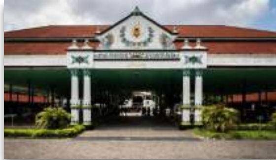
15 minutes drive to Sultan Palace