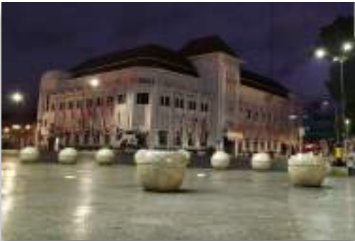
10 minutes drive to Titik 0 Km Jogja