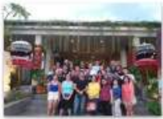
2019 - Bali