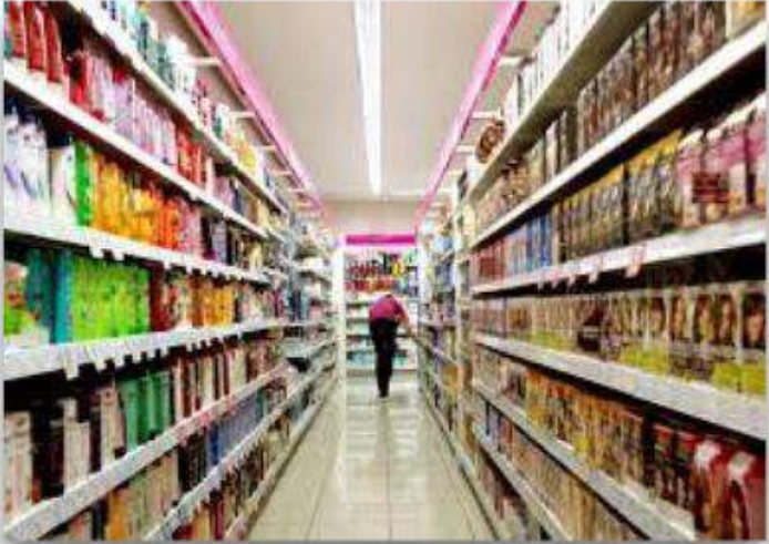
Fast Moving Consumer Goods