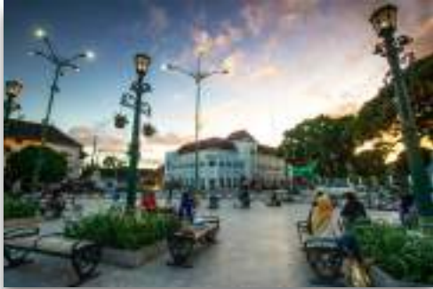
15 minutes drive to Malioboro