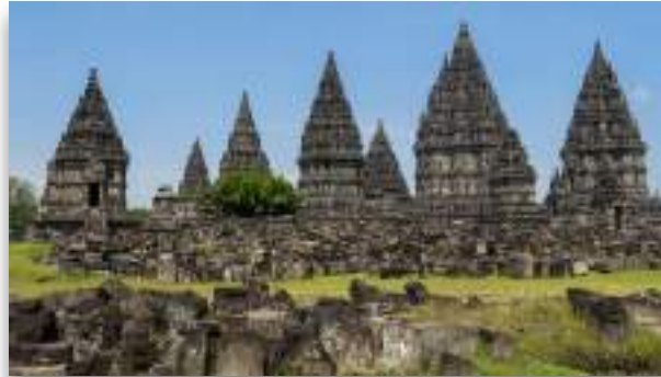
34 minutes drive to Prambanan Temple