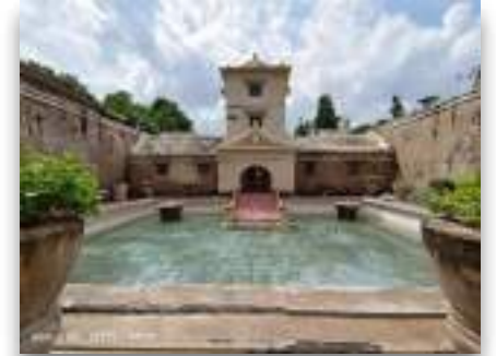
16 minutes drive to Kampung Wisata Taman Sari