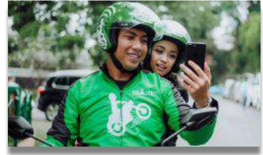
GoJek or Grab Car

Online transportation using a private motorcycle or car provided by Gojek or Grab. Downloadable for Android and iOS