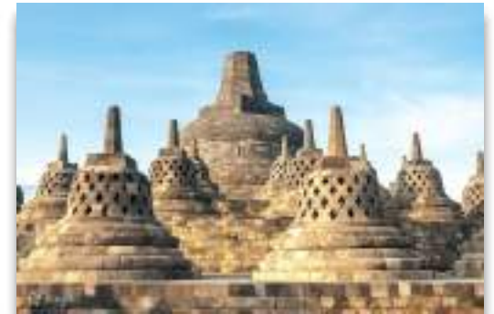
1 hour 10 minutes drive to Borobudur Temple